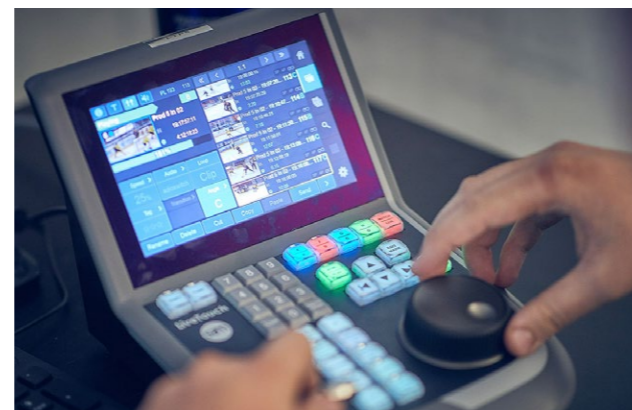
Grass Valley Live Touch

With Grass Valley's robust suite of live production resources, Streamteam can now seamlessly support mixed resolution media, UHD (2160p) and 3G (1080p). The production hub also supports new delivery platforms with publishing options to the web and VOD at multiple resolutions, driving audience share through the SM-liiga website and supporting metadata in and out to enable search by end users. The remote production hub has reduced the number of operational and technical staff needed at each event, saving budget and maximizing time and resource during live production.